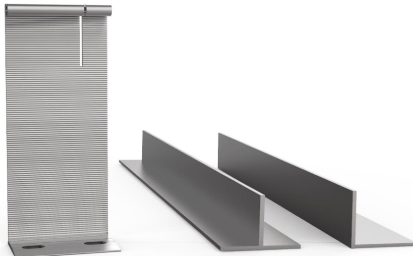
NVELOPE® Rainscreen Systems